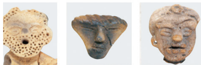
JOMON VILLAGE ARCHAEOLOGICAL SITE