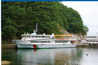
CRUISE ON MIYAKO BAY