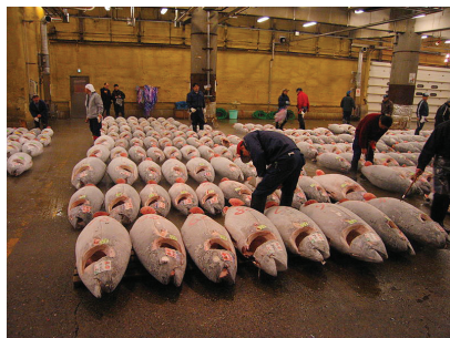
TSUKIJI MARKET IN TOKYO

Through presentations, discussions and hands-on experiences, the IPMEN 2014 conference will focus on how marine educators can help to a) address coastal recreation areas that have been devastated by natural disasters; b) prepare coastal areas for natural disasters; c) balance traditional ecological knowledge with science and technology, including within the fisheries industry; and d) foster an understanding of food cultures and traditions, including within fisheries.