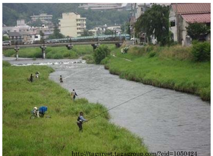
Ayu fishing in Nakatsugawa.

http://tagarest.tagagroup.com/?eid=1050424