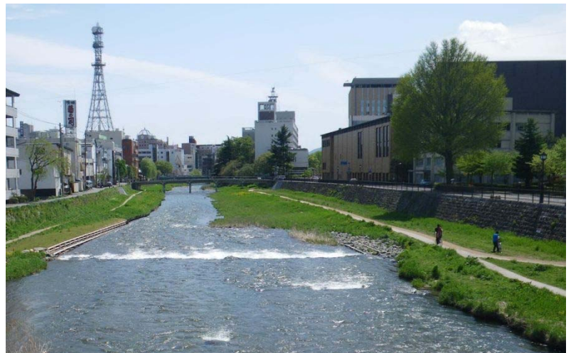
Nakatsugawa view near the visit site.