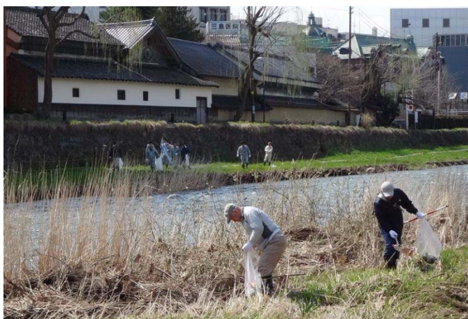
Cleanup by residents.